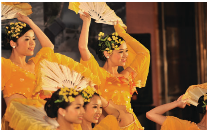
Vietnamese dancers entertained delegates