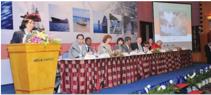
Panelists in the session on "Governance of marine areas beyond national jurisdiction"