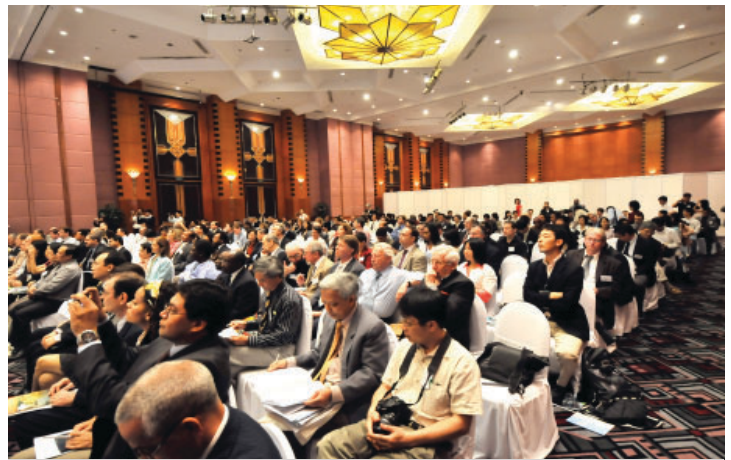
Participants during the opening session

towards a more coherent and integrated ecosystem and oceans management regime outside of national jurisdiction. She stressed the need for political courage, international responsibility, and the mobilization of resources and knowledge to introduce climate change planning into oceans and coastal management processes.